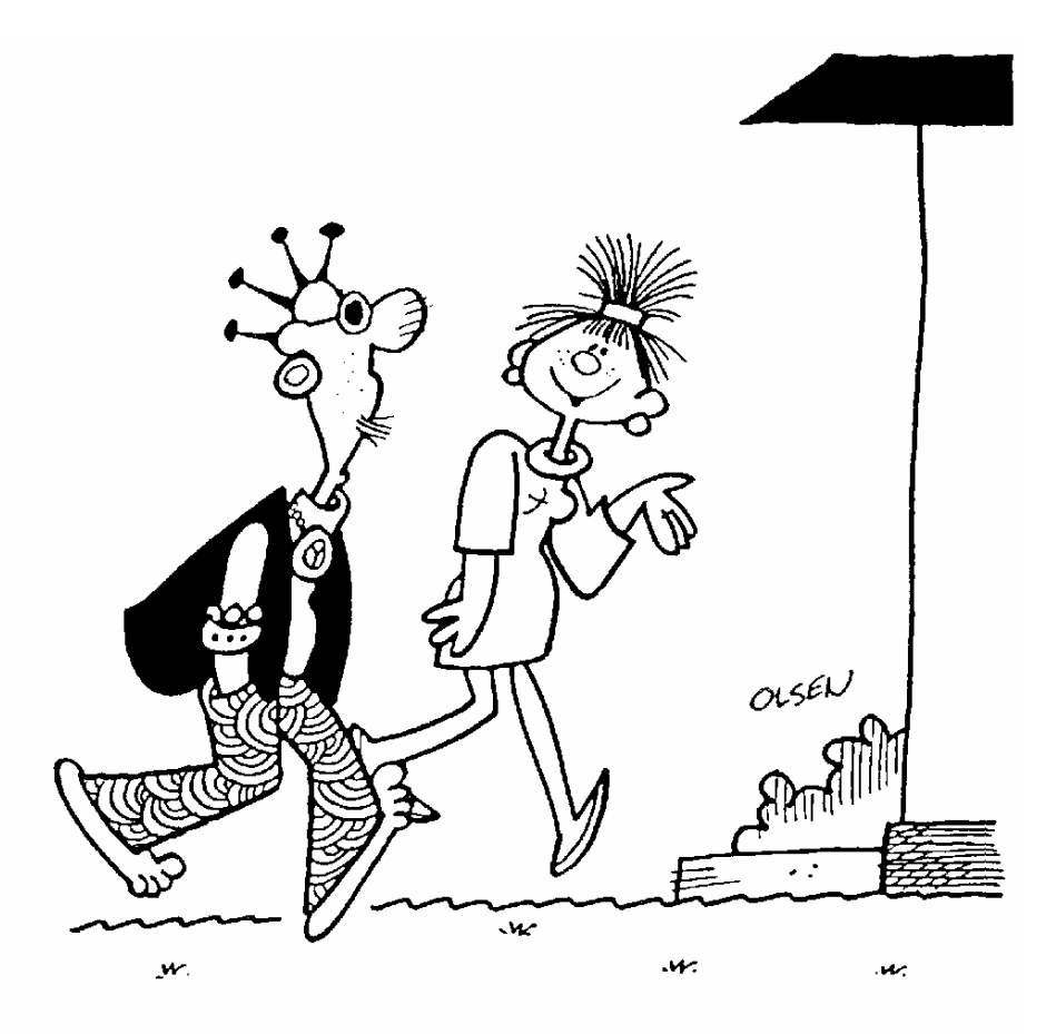
- JUST TELL MY DAD THAT YOU'RE A BRAIN SURGEON!